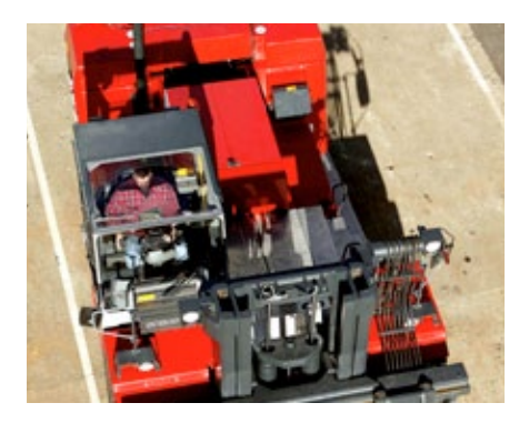
Improved 360 degree field of vision.