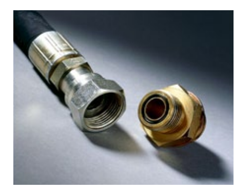
The sophisticated hydraulic system is equipped with leak proof ORFS- couplings for enhanced reliability.