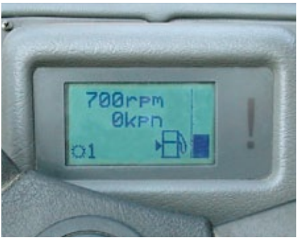
Essential information, warning messages and fault codes will be presented to the operator when needed.